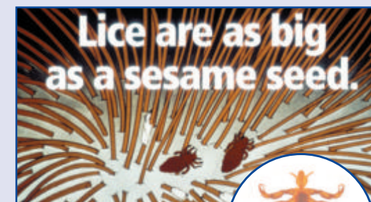
Illustration courtesy of Bayer Corporation